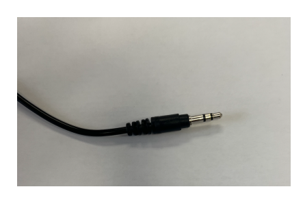
Headphones - Must have a straight jack for iPads